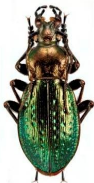
Fig. 8. Carabus obsoletus fossulifer Fleischer 1893