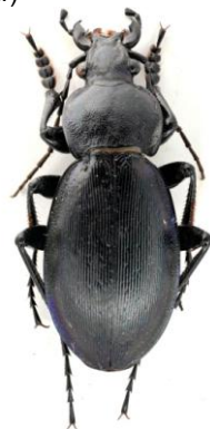
Fig. 9. Carabus hampei eximius Csiki 1906

With pitfall trapping (80 traps) in the course of the 2 years 1574 specimens of 60 carabid species were collected. In 2014 sampling was carried out from the end of April till beginning of October. The highest number of species (19) was observed in a beech forest (Huta) with dominant species Abax schueppelii . Almost as high species number (18) was detected in riverine willow scrub (Varsolc), here the most common species are Poecilus cupreus and Carabus granulatus . In oak forests two samplings were made, the species numbers were 14, and 16 respectively. In dry oak forest (Aluniş) the dominant species was Calathus fuscipes , in more wet oak forest (Iaz) Abax schueppelii was dominant. In loess sward (Aghireş) only 12 species were caught, here Calathus fuscipes has proved to be dominant.