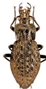
Fig. 6. Carabus variolosus Fabricius, 1787