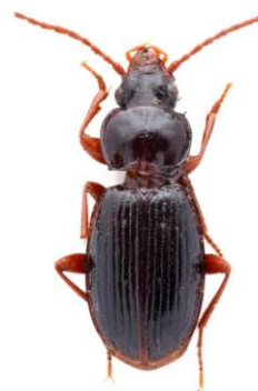
Fig. 5. Trechus amplicollis Fairmaire, 1859 (Foto: Tamás Németh)