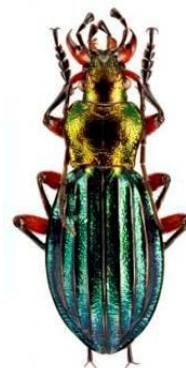
Fig. 7. Carabus auronitens escheri Palliardi, 1825