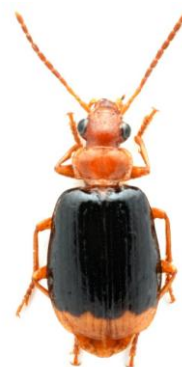
Fig. 4. Lebia marginata (Geoffroy, 1785)