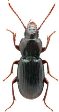
Fig. 2. Pterostichus bielzii Fuss, 1878

In Sălaj county during 2014–2015 with a variety of methods a total of 207 ground beetle species were sampled. Taking in consideration the earlier literature data the total species number amounts to 246. Worth mentioning is Carabus variolosus Fabricius, 1787 (Fig. 6), which is a Natura 2000 species, Pterostichus bielzii Fuss, 1878 (Fig. 2), is a species endemic to the Western Apuseni Mountains. Rare species: Dromius quadraticollis A. Morawitz, 1862 (Fig. 3), Elaphropus parvulus (Dejean, 1831), Lebia marginata (Geoffroy, 1785) (Fig. 4), Ophonus ardosiacus (Lučnik, 1922), Stenolophus steveni Krynicki, 1832, Trechus amplicollis Fairmaire, 1859 (Fig. 5). Carpathian faunistic elements: Carabus auronitens escheri Palliardi, 1825 (Fig. 7), Carabus linnei linnei Duftschmid, 1812, Carabus obsoletus fossulifer Fleischer 1893 (Fig. 8).